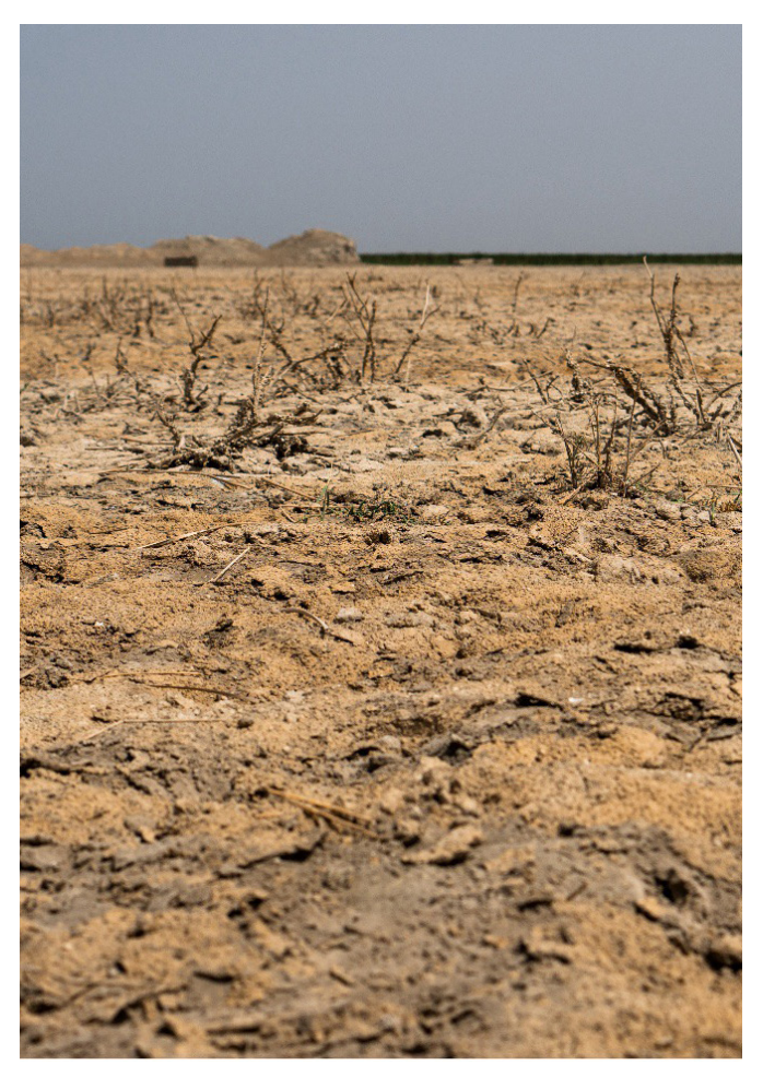
Figure 6: Dried crops in Al-Chibayish a district of the Dhi Qar Governorate, Iraq. (Source: Caroline Zullo/NRC, June 2022)

often evade these limits, and the measures taken have done little to address the underlying issues. The crisis committee's responses, such as allocating water trucks or loosening restrictions on well digging, have been reactive and short-term. It has failed to establish the necessary infrastructure to prevent future crises.