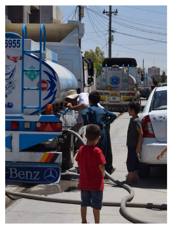
Figure 2: Multiple Water Trucks Supplying Houses in Erbil

We have not had water for twenty days! We demand water. You give us our salaries once in two months and I need to use it immediately to buy water with that salary. I don't know what to do. 77°