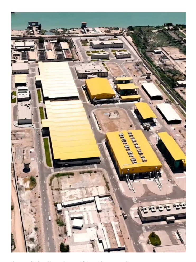
Figure 4: The Great Basra Water Treatment Project

We've noticed significant change over the past couple of years. In Basra, we're used to not being able to use the water at all, it's gotten a lot better. The government is doing more, but we'll see if it remains that way.