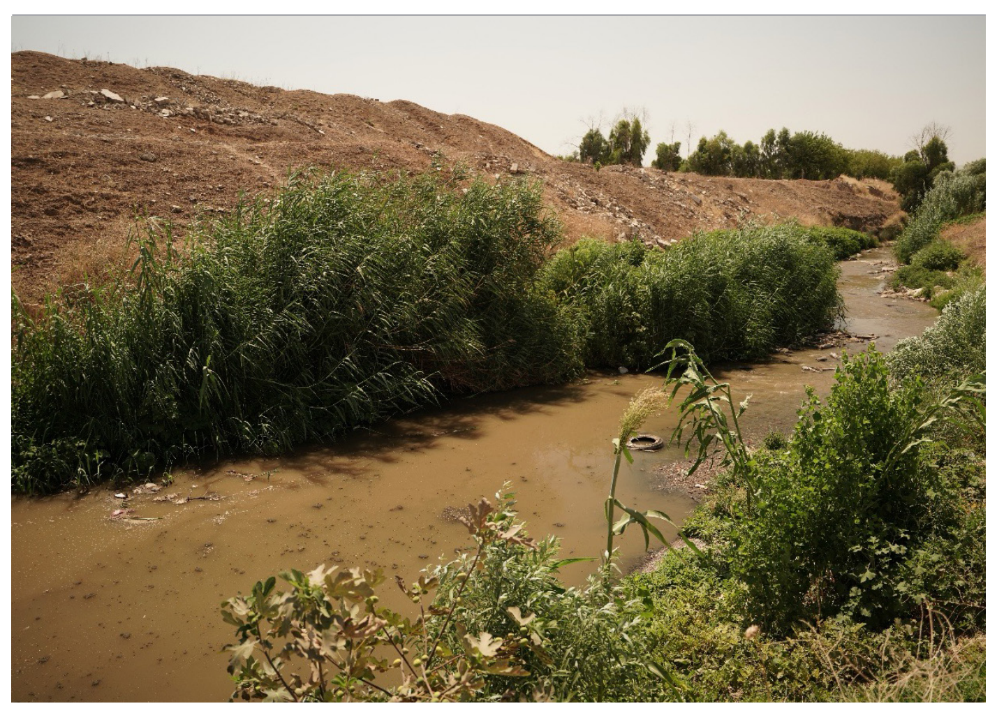
Figure 1: Municipal Sewage Running in a Canal in Sulaymaniyah

resistant crops, solar-powered agricultural equipment, or resilient fisheries, miss the scale of the problem. These approaches, while potentially useful in benefitting small groups of individuals, are too narrow to address the widespread and systemic nature of Iraq's water crisis. Substantial investment in essential infrastructures (e.g., water treatment plants, water grids, covered irrigation canals) is required to preserve and protect Iraq's water resources in an era of climate change, meaning that political dialogue at local and national levels will be crucial to build consensus among stakeholders and mobilize the necessary resources for holistic reforms.