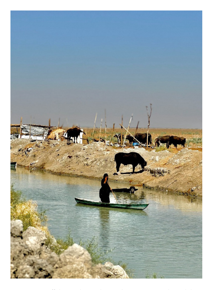
Figure 5: A Buffalo Herder in Dhi Qar

the narrower the river becomes. The river that covers these areas gets narrower and has less water flow as it moves downstream and approaches the marshes." They added that these are agricultural and tribal areas, which raises the risk of social grievances and tensions over water.