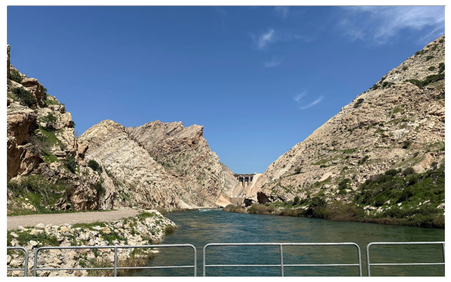
Figure 3: The Darbandikhan Dam

should not drink from local water sources due to the accumulation of pollution, but the town's water treatment facility remains incomplete and inoperable. Citizens and community leaders are exasperated about the lack of progress. The town's mayor expressed his frustration, saying: