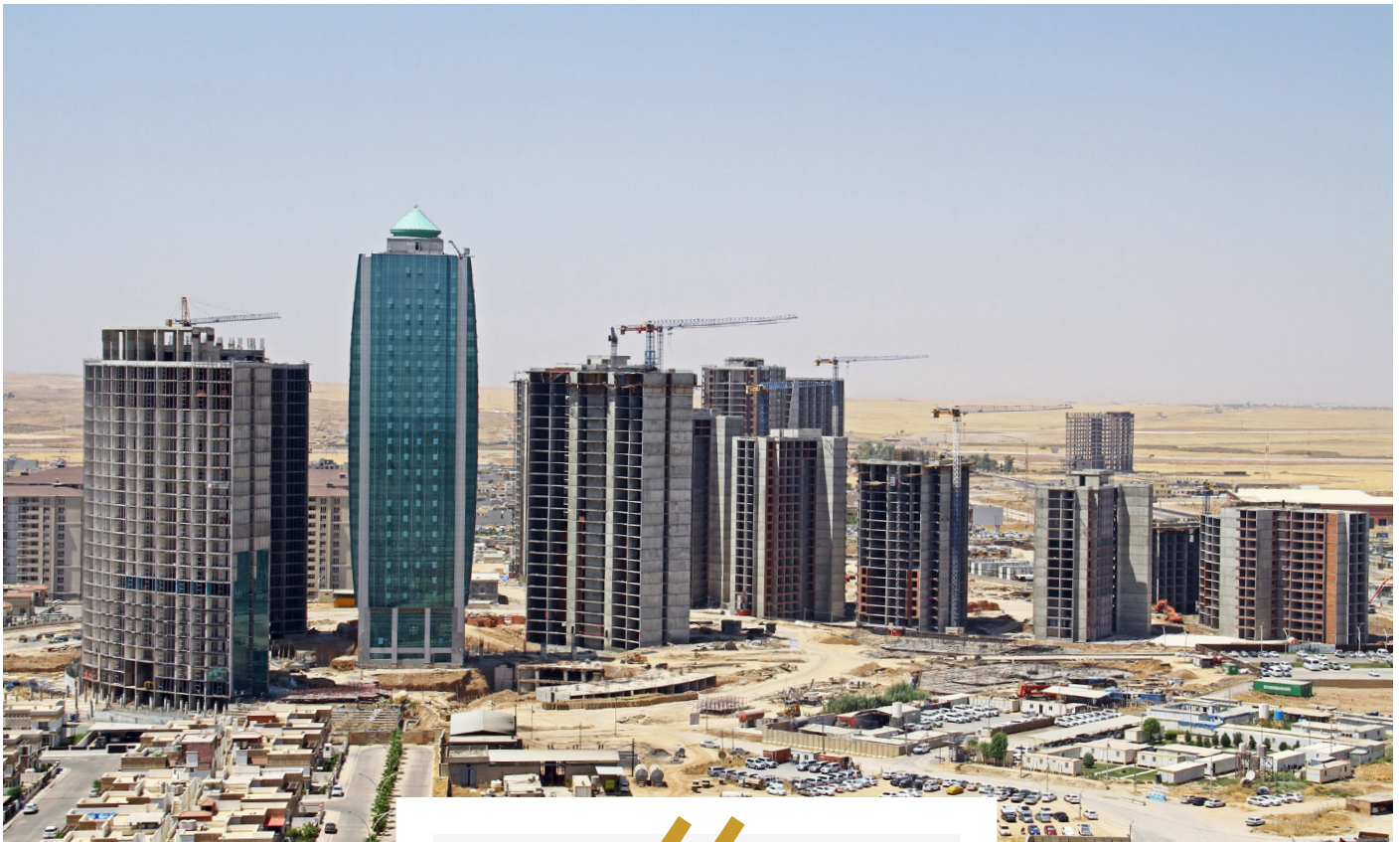
Skyscrapers in Erbil, Kurdistan.

is a positive step forward, I'm still skeptical about the urban planning of Al-Rafeel as it's currently following the project's flow on an ad hoc basis rather than putting sensible parameters to guide the project. We're suffering from a lack of futuristic vision for Iraq and operating in survival mode.