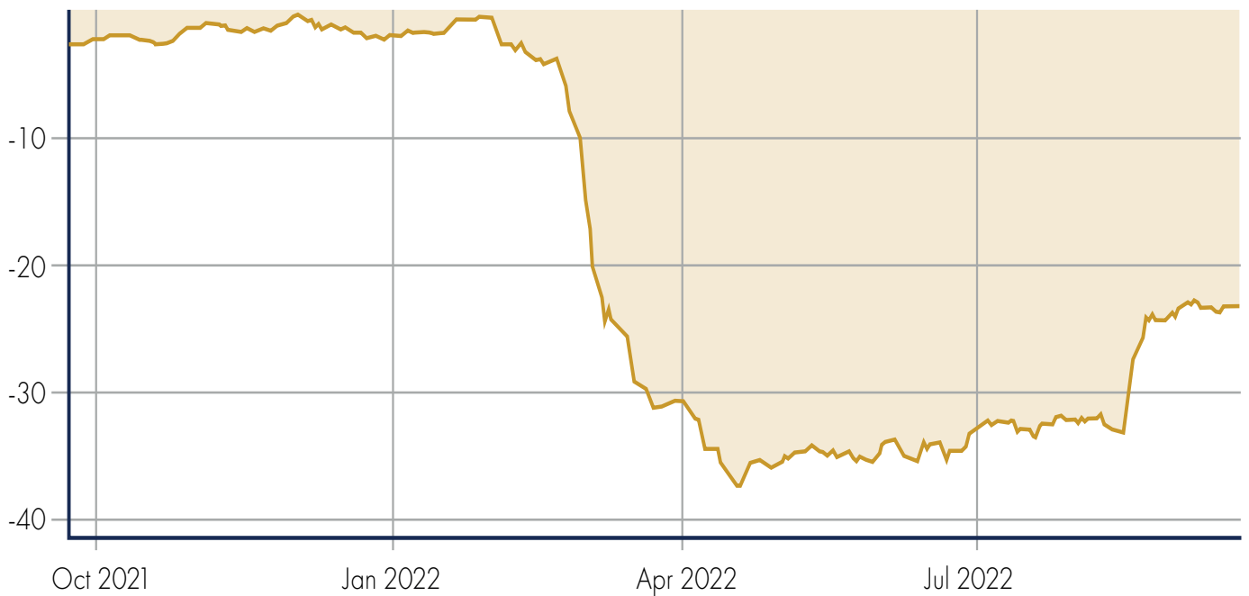
Chart 2: Urals – Brent Price Differentials (USD/ per barrel)