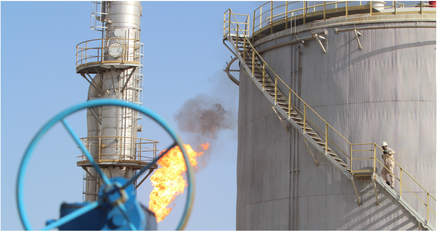
Bazerkan oil field in the city of Maysan, south of the capital, Baghdad Iraq. January 21, 2016.

Two of the events, the Federal Supreme Court (FSC) ruling on the unconstitutionality 3 of the KRI Oil and Gas Law (KOGI) 4 and the invasion of Ukraine, happened in quick succession in February of this year. In July, news broke that that Iraq's eight-year-old arbitration case against Turkey and state-owned pipeline operator BOTAS would finally be concluding by year-end in Iraq's favor. 5 These three events, while not directly related, are linked in their bearing on the monetization of the KRI's oil exports.