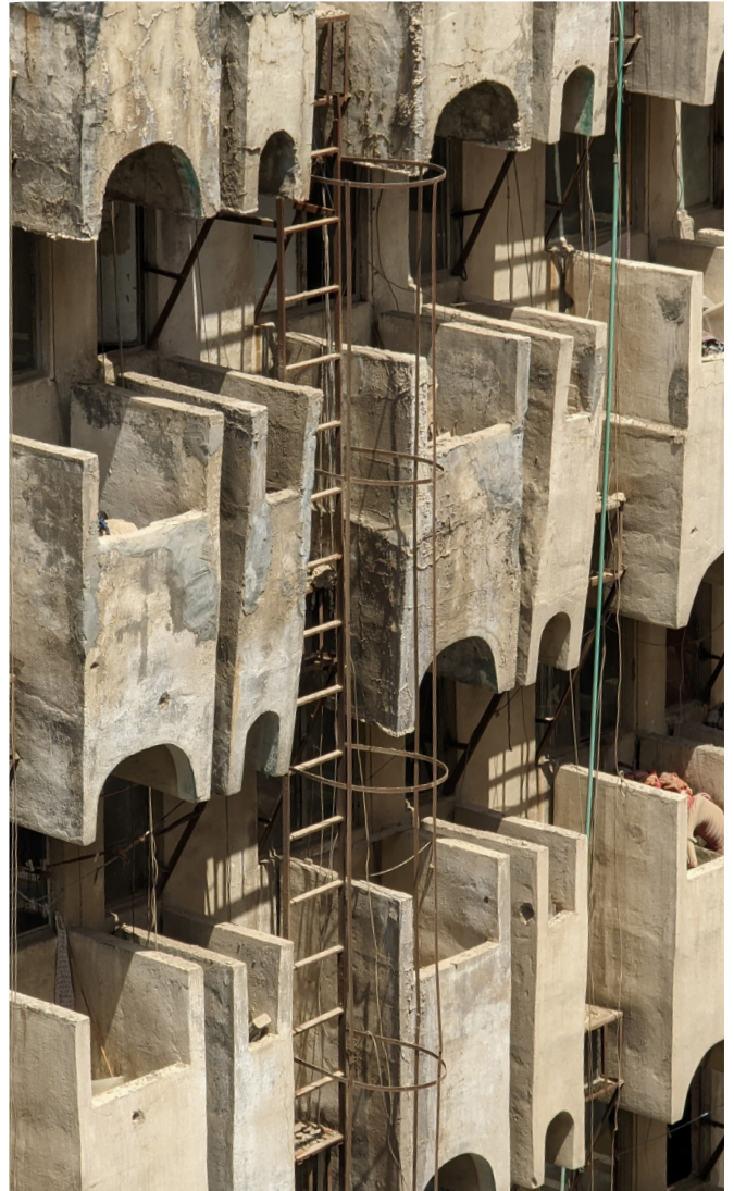
Buildings in the street in Basra city. August 19, 2022.

Ghani: We're going to launch a new visual identity that reflects our vision for the next few years. We are aiming to position ourselves as reformers and not only marketers, addressing issues like pollution, lack of adequate spaces, traffic jams, lack of planning, and a human-centered development approach. We will do that by writing articles and content that not only highlight the issues in Iraq but also provide solutions with tangible examples. Baghdad Projects is a platform that prioritizes raising awareness and standards for the residents of Baghdad. We've already succeeded in changing the perception of people of the Central Bank tower project by launching a campaign to rename it "Zaha Hadid's Tower." The feedback we received was quite positive due to that personal touch -- since Zaha was one of us, an Iraqi. I might not be an architect, but I love my city and always hope for the best for our beloved Baghdad and its good people, despite all the circumstances and challenges.