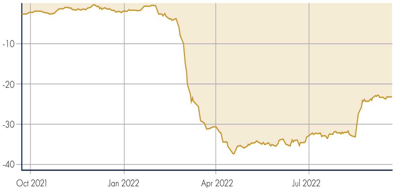
Chart 2: Urals – Brent Price Differentials (USD/ per barrel)

(Source: neste.com , data as of August 26 th , 2022)