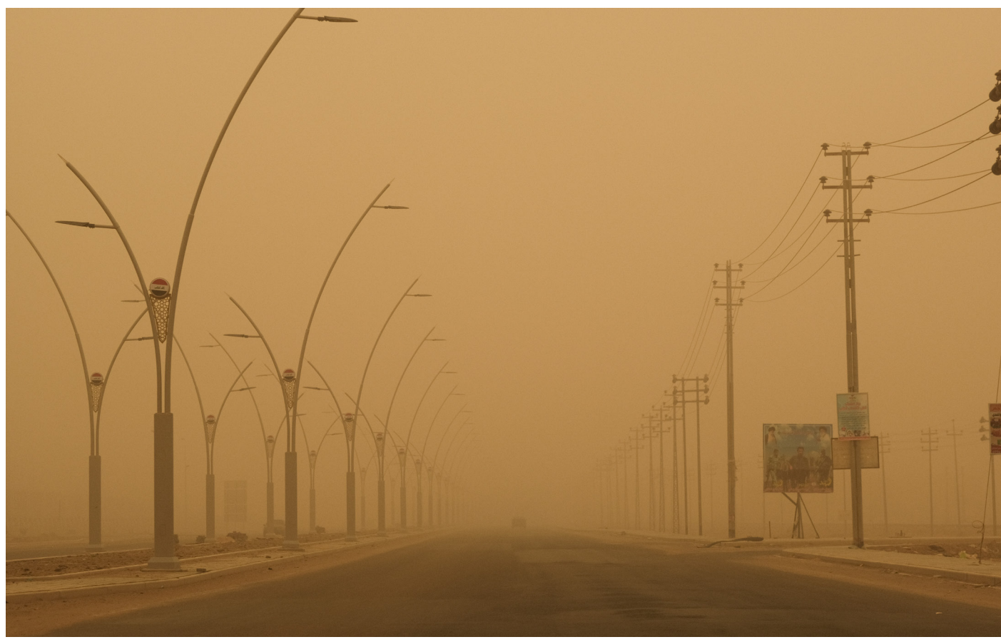
Sand Storm in Basra, Iraq. May 23, 2022.

from its arable lands,<sup>11</sup> and to a drop in pasture area and the productivity of cultivated land. Additionally, as Mohammed Al Allaf, Dean of the Faculty of Agriculture at Mosul University, argued during a recent forum on climate change, water shortage and poor agricultural practices have led to the decrease of tree-covered land from 60% to 4%.<sup>12</sup> Soil degradation, droughts, and the dramatic decrease in local vegetation and arable lands are all factors directly connected to the increase in SDSs. Allaf issued a dire prediction that, "Everyone will lose with any environmental collapse." <sup>13</sup>