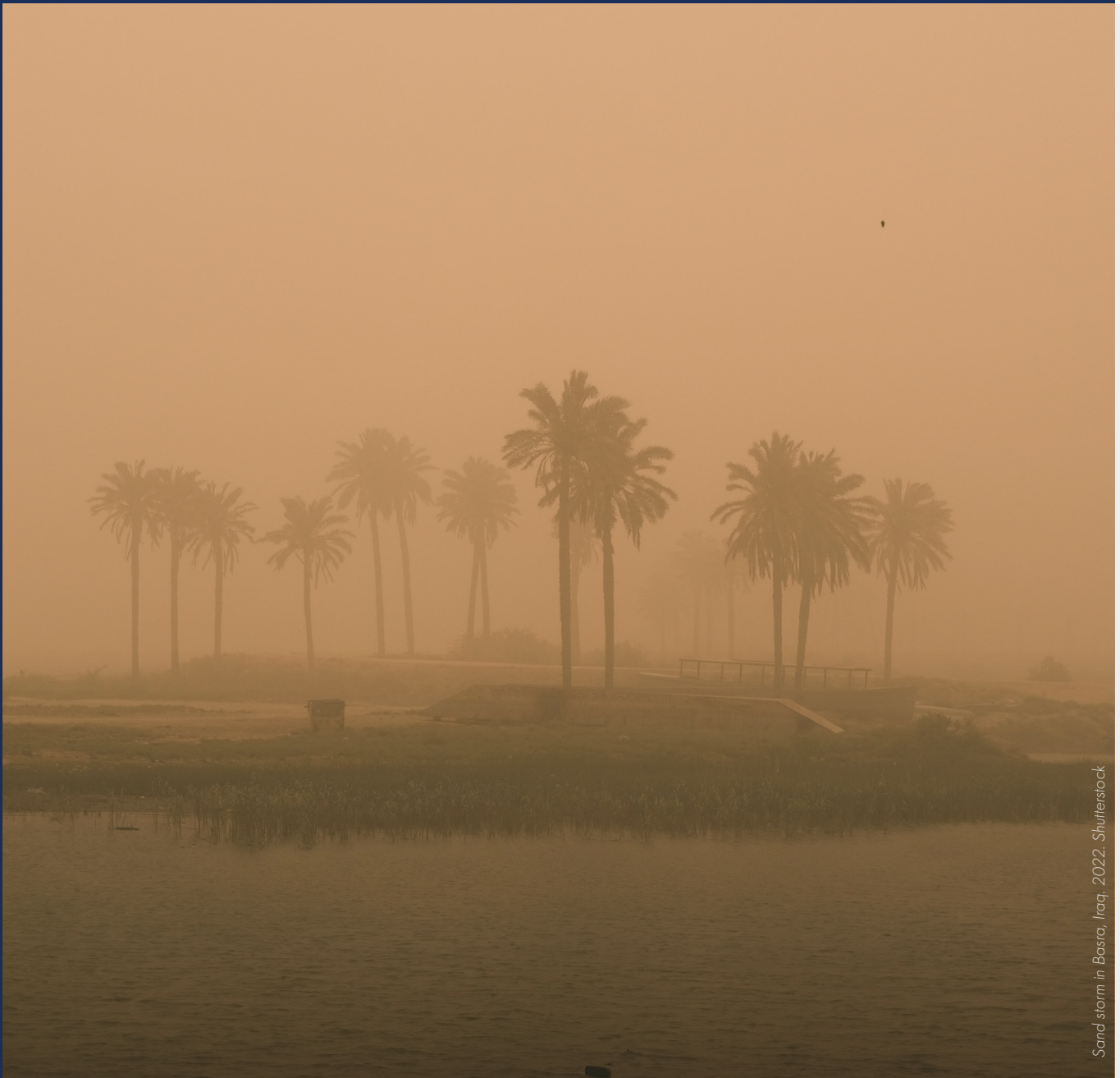
Sand storm in Basra, Iraq, 2022.