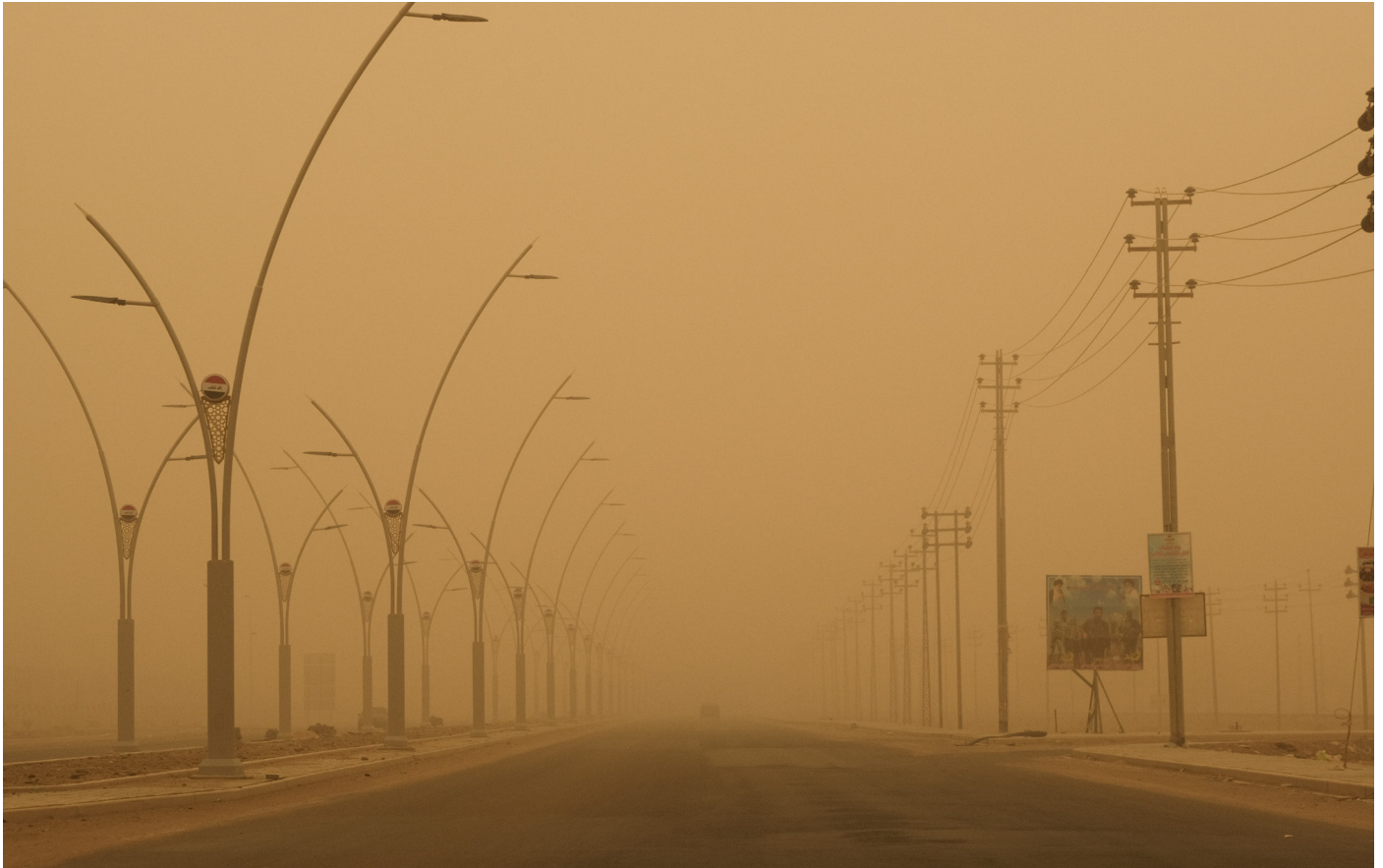
Sand Storm in Basra, Iraq. May 23, 2022.

from its arable lands, 11 and to a drop in pasture area and the productivity of cultivated land. Additionally, as Mohammed Al Allaf, Dean of the Faculty of Agriculture at Mosul University, argued during a recent forum on climate change, water shortage and poor agricultural practices have led to the decrease of tree-covered land from 60% to 4%. 12 Soil degradation, droughts, and the dramatic decrease in local vegetation and arable lands are all factors directly connected to the increase in SDSs. Allaf issued a dire prediction that, “Everyone will lose with any environmental collapse.” 13